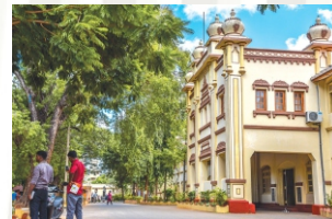
UNIVERSITY OF JAFFNA, SRI LANKA