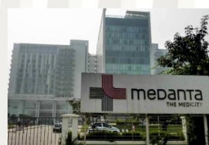
MEDANTA- THE MEDICITY, GURUGRAM