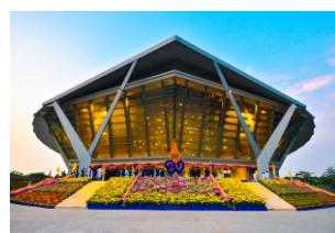
MAHIDOL UNIVERSITY, BANGKOK, THAILAND