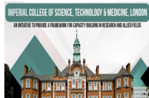
IMPERIAL COLLEGE OF SCIENCE, TECHNOLOGY & MEDICINE, LONDON AN INITIATIVE TO PROVIDE A FRAMEWORK FOR CAPACITY BUILDING IN RESEARCH AND ALLIED FIELDS