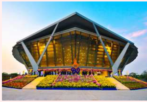
MAHIDOL UNIVERSITY, BANGKOK, THAILAND