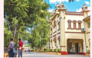
UNIVERSITY OF JAFFNA, SRI LANKA